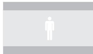
SCOPE (2048 X 858)

All files must contain: 10 frames slate, 10 frames black, a visible "2-beep" (one frame of 1KHZ tone placed 2 seconds ahead of first frame of picture), followed by 47 frames black, followed by first frame of picture ( see below ).