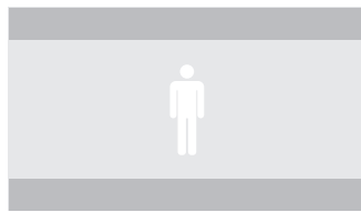
SCOPE (2048 X 858)