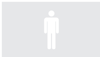
FLAT 1:85:1 (1998 X 1080) OR HD 16X9 (1920 X 1080)

Flat & Scope versions are required for all spots.