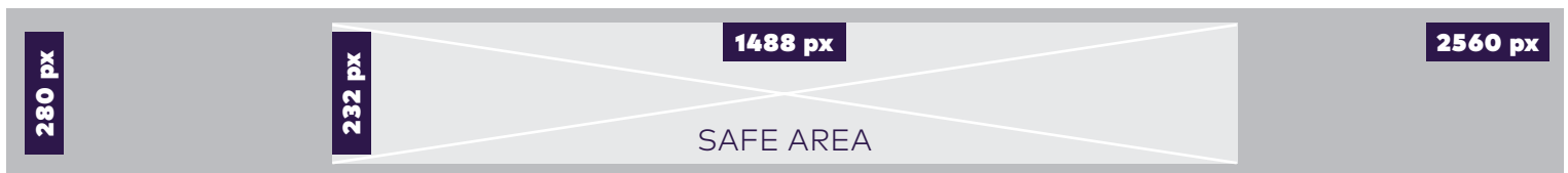
SUPER LEADERBOARD - DESKTOP | TABLET