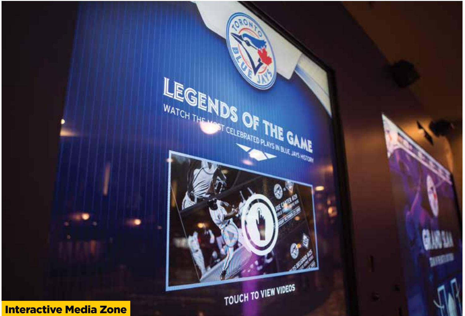
Interactive Media Zone