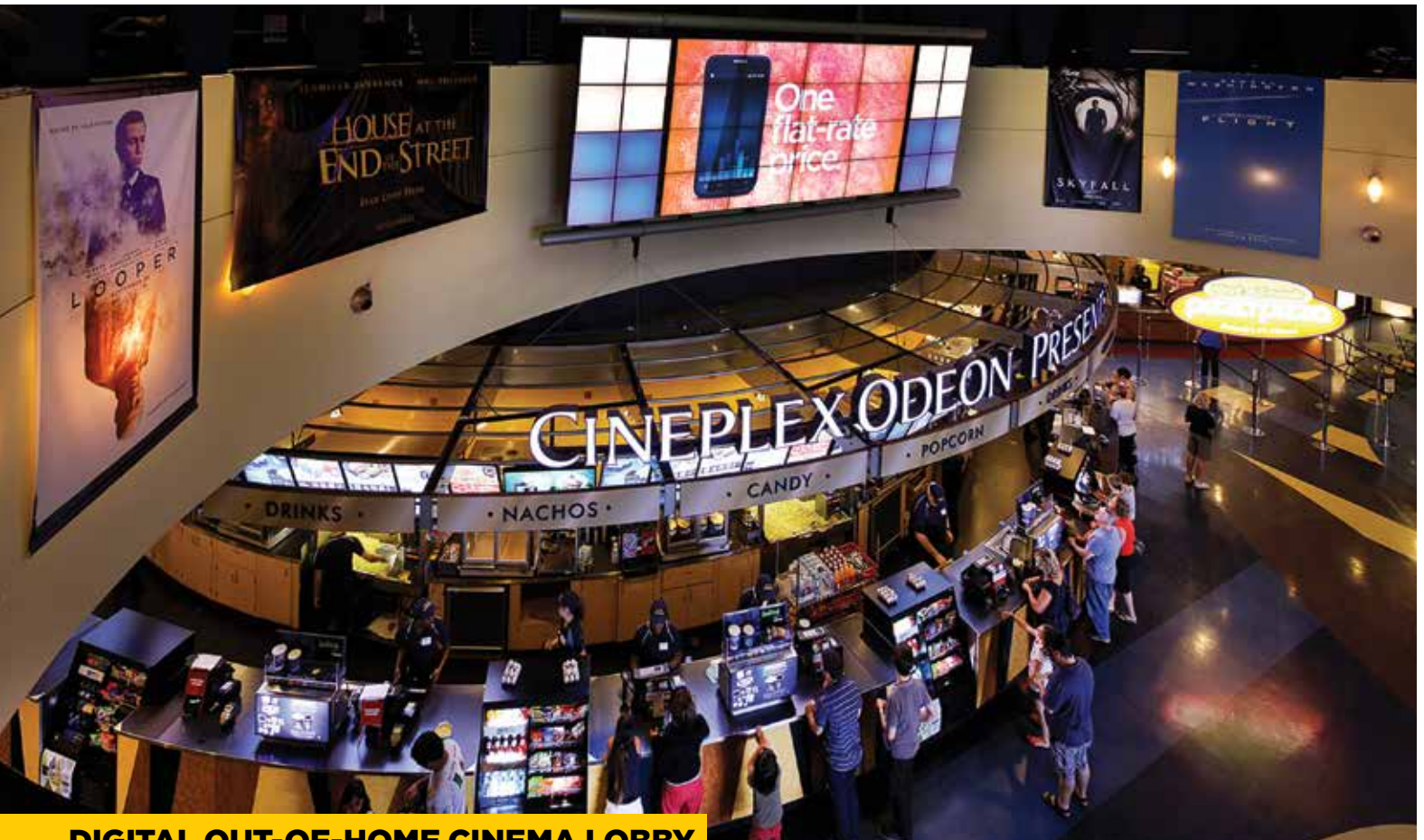
DIGITAL OUT-OF-HOME CINEMA LOBBY