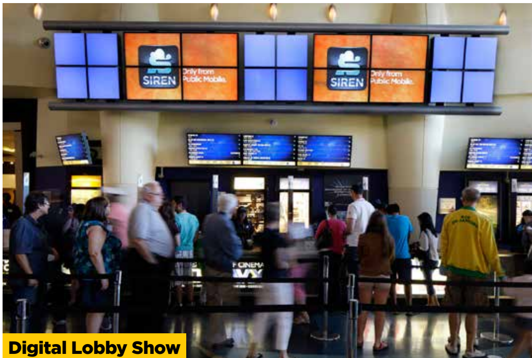
Digital Lobby Show